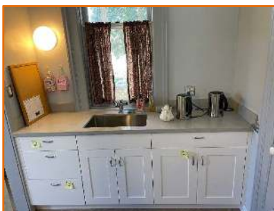
Prep Area off Kitchen