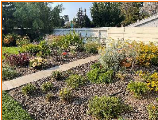
Rear Garden area above and below

Please stop by PHM to admire the changes that have been made.