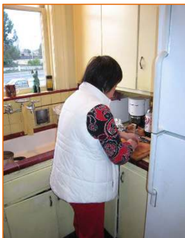
Tea Lady Working Hard!