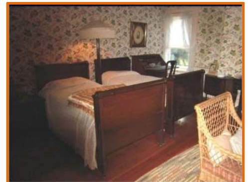
Carol's Bedroom at the Pardee Home

One big difference was that in the 1918 Pandemic children were affected more than older adults were, whereas it is reversed in the current Pandemic. No reason for this has been determined, but it possible that in 1918 older adults had been exposed to a virus in their lifetime that gave them some protection whereas children had not had the same exposure.