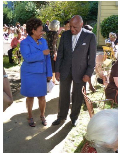
Congresswoman Barbara Lee and Willie Brown at the PHM

Note from Editor: During Willie Brown's speech at the P.O.W.E.R. event he commented about the Pardee Home Museum saying: "I didn't know this place existed. It is absolutely lovely!" Thank you Mr. Brown! We agree.