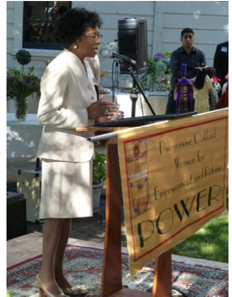
Belva Davis at the Podium

accomplishments and trade a few good-natured jibes. A display of character dolls from a current exhibit at the African-American Museum was set up on a table under the oak tree. The formal tablecloths, settings and decorations were exquisite; everyone expressed interest in repeating the event next year.