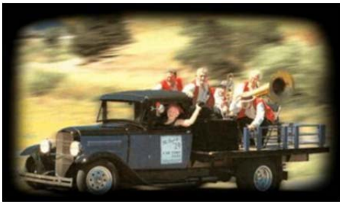
Spirit of '29 Dixieland Jazz Band