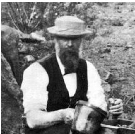
Carleton Watkins – Self Portrait

As you enter the Pardee Home your attention is immediately drawn to a fixture hanging from the ceiling further back in the hallway. It has 6 large glass photographic images of Yosemite Valley. Each is signed by the photographer Carleton Watkins (1829-1916), considered to be the Ansel Adams of the 19 th Century.