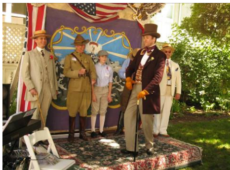
Dapper Dan Contestants

What better way to celebrate America than with a good old fashioned picnic? The Pardee Home features many more events throughout the year. We hope to see you at our next picnic or event, if not before!