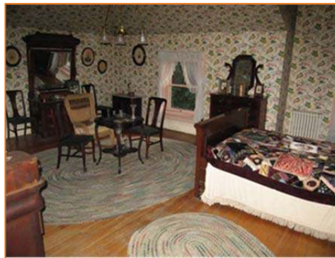
Master Bedroom showing Crazy Quilt on bed (see enlarged photo of quilt on back page)