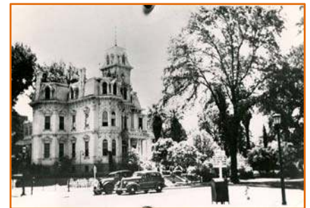
Old Governor's Mansion as it looked in the 1930's

train; Florence (15 years old) a rose pink dress with a transparent lace yolk; Madeline (13) a white crepe dress; Carol (11) a light blue silk dress; and Helen (7) a gaslight green dress. Orchestras played in the Rotunda, the Senate and Assembly Chambers. The gala ball did not end until 2:00 AM the following morning.