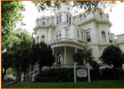
Old Governor's Mansion as it looks today