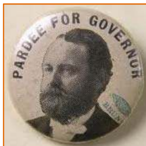
Pardee's election pin

In the nomination of 1897 George was pitted against Henry Cage, a candidate who was beholden and heavily supported by the railroad. George had fought against the railroad when he was Mayor of Oakland (1894-1896). Cage narrowly won the nomination and became Governor. George had enough support that it was thought he would even have more support in the following election (1902).