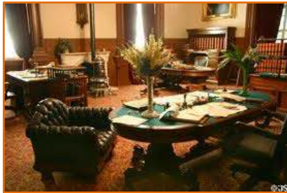
Pardee's office at the Capital can be visited today on Capital Tours. Governor Pardee's suite of offices was selected to be recreated as they looked during his term (1903-1907).

Despite only one term, George had a successful four years and should have been reelected. It was again the Railroad who determined the outcome. George was present at the nominating convention but did not head the Republican Party, again because of SP (Southern Pacific). Instead, backed by the Railroad and party machine boss Abe Ruef, James Gillett (Humboldt County) was nominated, won the election and became California's Governor (1908-1912). Next time, more about what Governor Pardee accomplished during his Governorship.