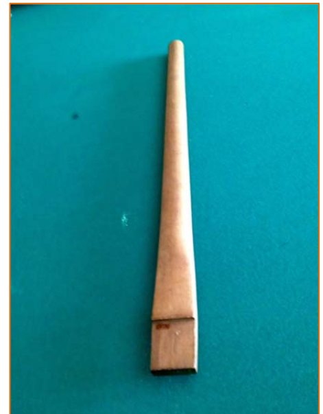
Spoke Handle found in left Curio Room Closet