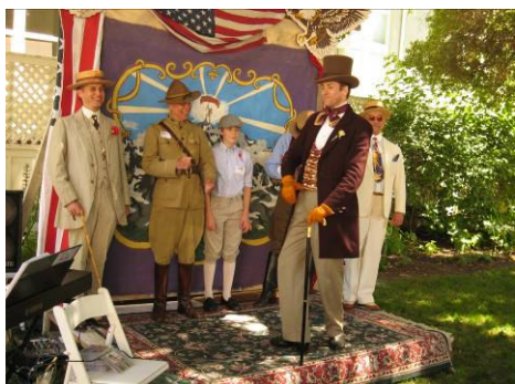
Dapper Dan Contestants

What better way to celebrate America than with a good old fashioned picnic? The Pardee Home features many more events throughout the year. We hope to see you at our next picnic or event, if not before!