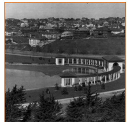
Oakland Pergola and Colonnade

In addition to Frank Mott being known as "the Mayor who built Oakland" he is Oakland's "Earthquake Mayor" for his tireless work in bringing Oakland back after the April 18 th , 1906 earthquake. He worked day and night at Oakland's City Hall alongside Governor Pardee who was residing (that is camping out) at the City Hall for weeks. Governor Pardee was getting State and Federal aid for San Francisco, supervising the evacuation of San Francisco, keeping banks open, and supervising the health needs of a natural disaster while Mott was doing similar work for the city of Oakland.