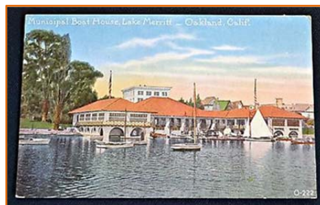
Oakland Boathouse, 1920s (now Lake Chalet Restaurant)

Mott's mayoral reign is still marked by the most successful "City Beautiful Movement" that was occurring throughout the United States. These include the building of Oakland's City Hall, the Oakland Civic Center (the Kaiser Convention Center), the development of Lake Merritt including Oakland's first Municipal Boat House, the Pergola (Colonnade) and Loggia, the beginning of the construction of the Band Stand and more. Mott was also responsible for establishing Oakland's first public museum in the historic Camron-Stanford House which was the forerunner of the Oakland Museum of California (1969). It was Mayor Mott who hired Curator Charles Wilcomb from San Francisco's DeYoung Museum to begin Oakland's remarkable development of its Museums.