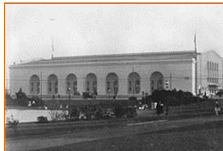
Oakland Civic Center, 1917 (now Kaiser Convention Center)

smarting over his participation in the anti-labor stance against unemployed males in the previous depression.