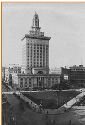
Oakland City Hall, 1917